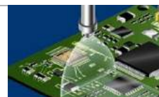
Electronics (PCB Flux & AS-AF)

Food Product Coating Lubrication Tablet Coating Electronics Moisturizing Recirculating Systems Spraying Viscous Liquids: butter, sugar, wax, syrup, Non-skid coatings, film coatings